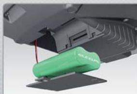
Easy exchangeable accumulator.