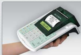
Perfectly suitable for every hand.