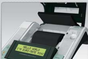
Drop-in system for easy paper rolls changing to reduce your downtime.