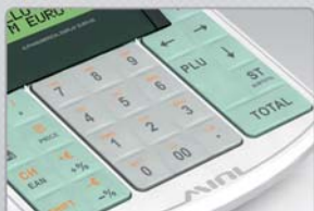
Durable silicone keypad with comfortable large keys.