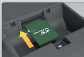
SD memory slot for import and export of items.