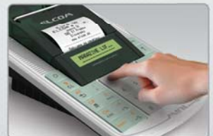
Customer display with large figures.