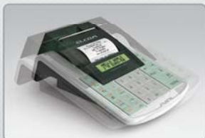
High durability against less friendly treatment.