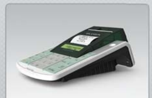
Ergonomic, modern designed cash register.