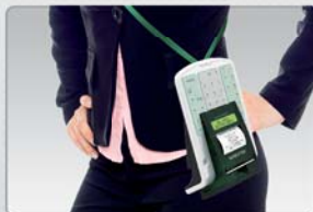
Carry it round your neck or over our shoulder.